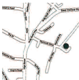
RALEYS GYM Plymouth Drive, Sevenoaks, Kent TN13 3RP