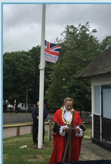
Raising the flag on The Vine on Armed Forces Day