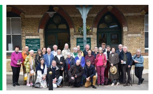
From top left: Eynsford Station; platform shelter; NRHA Ceremony

Second row: Otford station spring planting; Otford station history posters; Sevenoaks planters team Third row: Rail Trails pack; Guided Walk from Eynsford; Poster Array Swanley; Sevenoaks School team Bottom row: Sevenoaks Camera Club/DVCRP exhibition; Friends of Pontoise visit to Bat & Ball