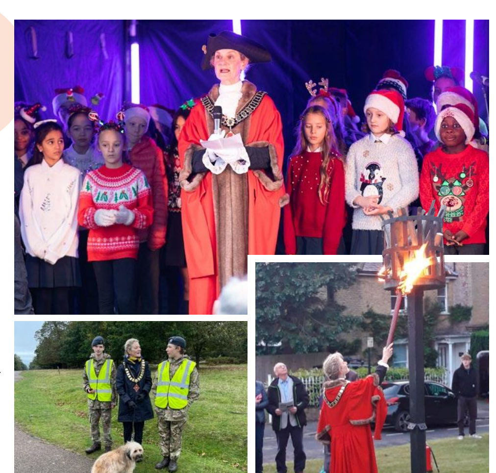
The Mayor and local school children at the Christmas Lights event 2024 (top) with cadets in Knole Park and lighting the beacon for D-Day 80th in June

It is always interesting to gain an insight into the voluntary groups and charities which are supported in other locations