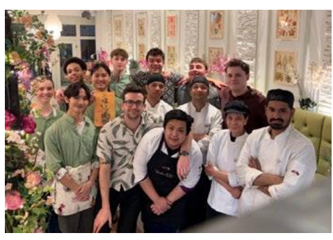
Rafferty's café (top) and the Giggling Squid team scored top marks