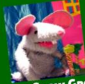
11am Snow Grey