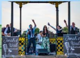
JONAH'S WAIL Sunday 22 June

VINE BANDSTAND FESTIVAL SUNDAY AFTERNOON CONCERTS 3pm - 5pm