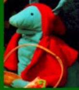
1pm Little Red Riding Hood