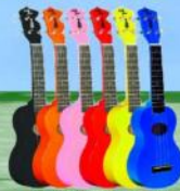
SEVENUKES Sunday 29 June