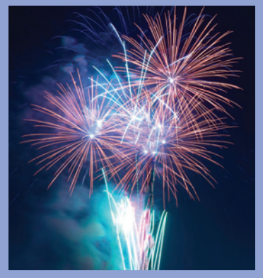
7th November Torchlight Parade & Fireworks Evening High Street

27th November Christmas Lights Switch On 6.00 p.m (7.30 for lights) High Street