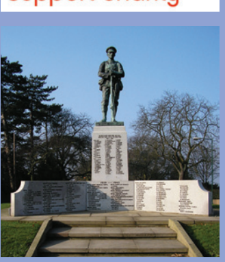
8th November Remembrance Service 10.50 a.m War Memorial