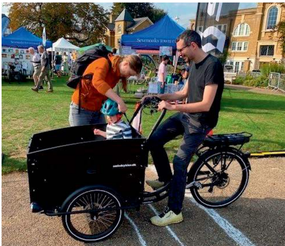
Sevenoaks Bike Festival (above) drew families and biking enthusiasts to the Vine

Sevenoaks is generally regarded as a great place to live and work, often being in the top rankings of towns surveyed by national and regional newspapers and magazines. However, it takes investment of all kinds to