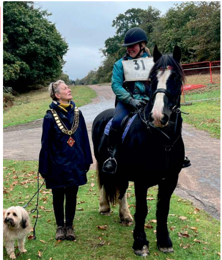
The Mayor at the Riding for the Disabled event in Knole Park and (left) at the Civic Service earlier this year

Once again, this event would not have happened without the huge effort and support of volunteers in the community. It