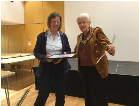
West Kent Housing Association