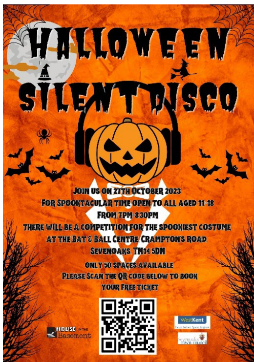
Figure 1: Halloween Silent Disco poster.

A Halloween Silent Disco, working in partnership with West Kent Housing, is to be held at the Bat & Ball Centre on October 27 th .