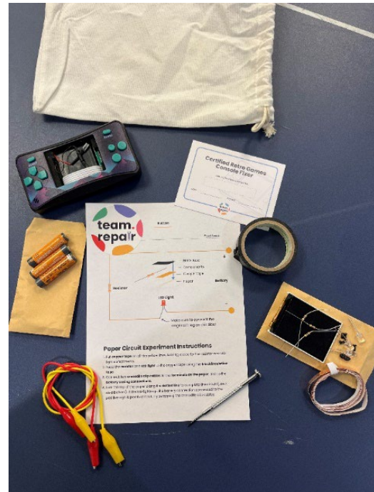
Figure 1: Contents of the retro games kit bundle.

The first workshop involved working on retro games consoles.