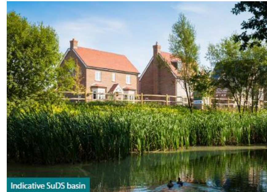
Indicative SuDS basin