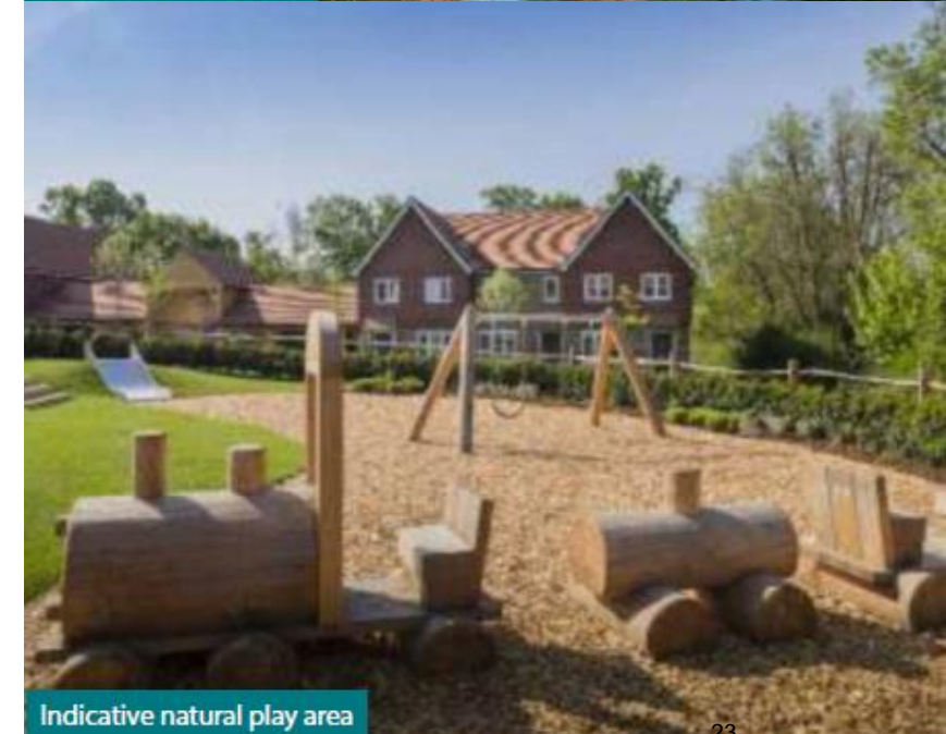
Indicative natural play area