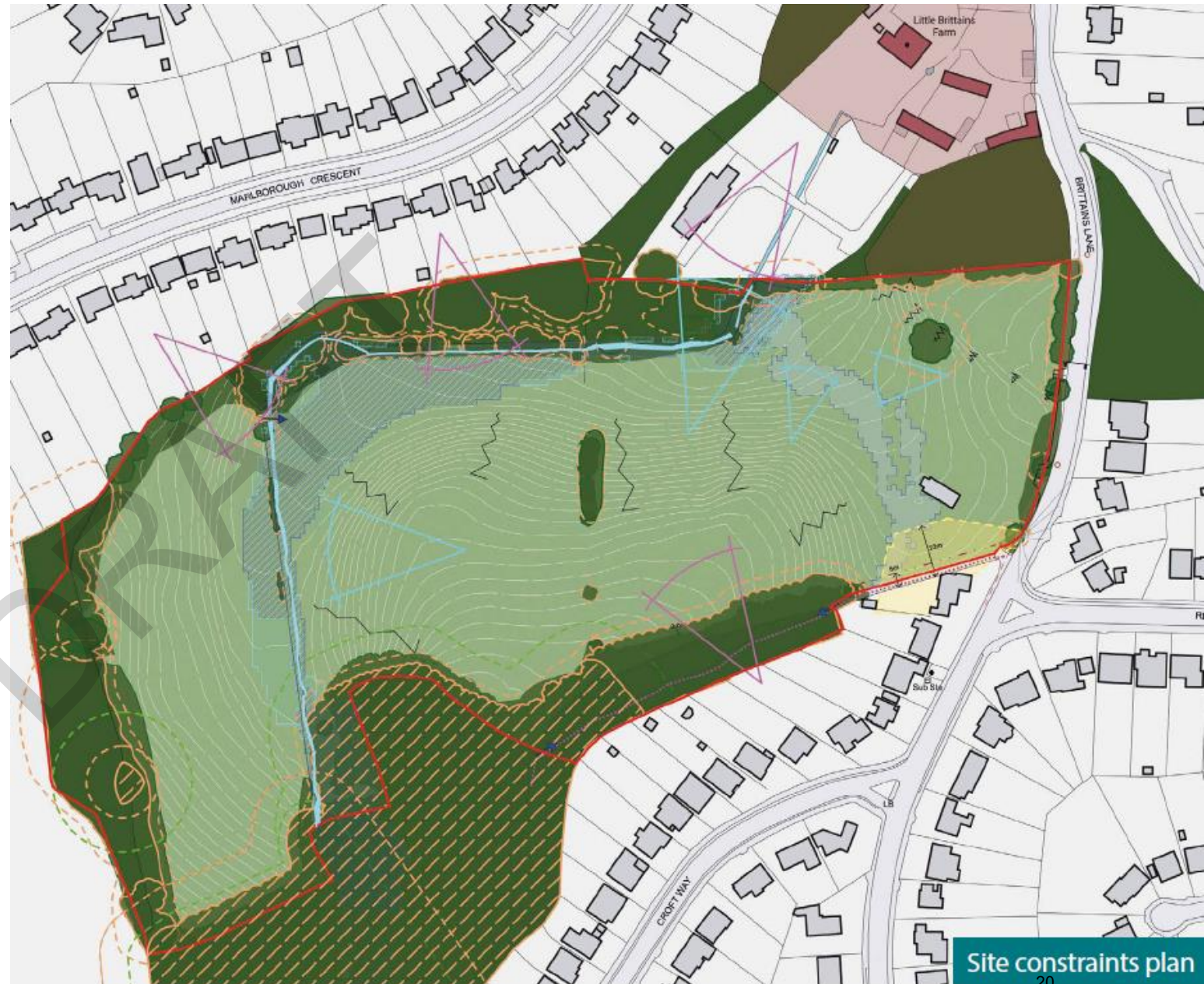
Site constraints plan