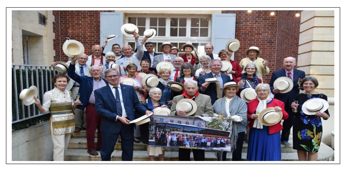
Canvas presented to Pontoise Town from Sevenoaks in May 2022

In May 2022, members of our group visited Pontoise, the French town twinned with Sevenoaks. The grant of £250 covered the cost of a canvas print of both groups and other gifts totalling £124.50. These were presented to Les Amis de Sevenoaks and the Pontoise Town Council.